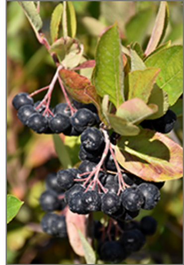
Viking Chokeberry fruit

This shrub should only be grown in full sunlight. It is an amazingly adaptable plant, tolerating both dry conditions and even some standing water. It is not particular as to soil type or pH, and is able to handle environmental salt. It is somewhat tolerant of urban pollution. This particular variety is an interspecific hybrid.