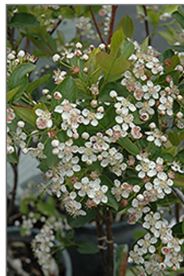
Viking Chokeberry flowers