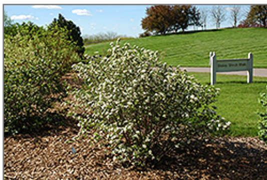
Autumn Magic Black Chokeberry in bloom