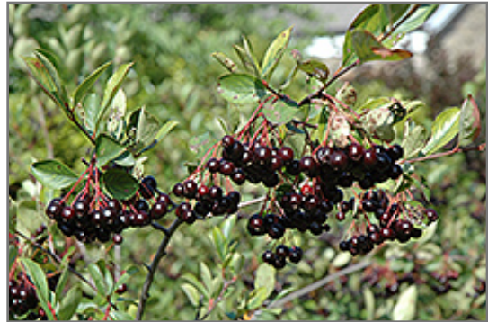
Autumn Magic Black Chokeberry fruit

This shrub should only be grown in full sunlight. It is an amazingly adaptable plant, tolerating both dry conditions and even some standing water. It is not particular as to soil type or pH, and is able to handle environmental salt. It is somewhat tolerant of urban pollution. This is a selection of a native North American species.