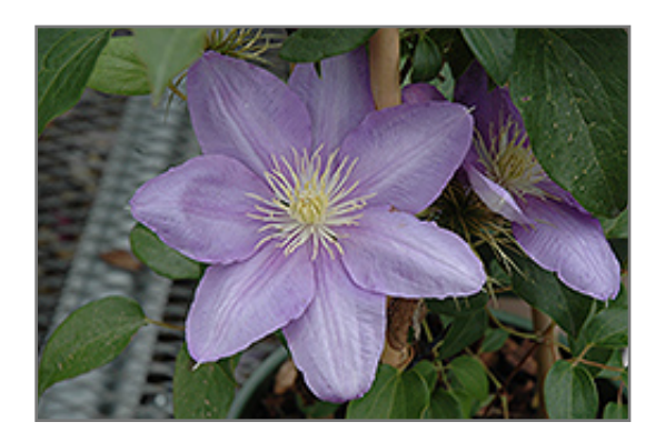
Cezanne Clematis flowers