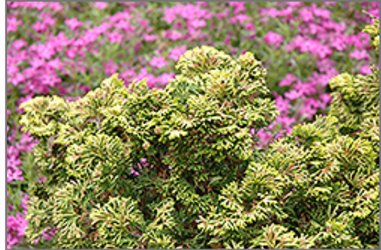
Verdon Dwarf Hinoki Falsecypress foliage