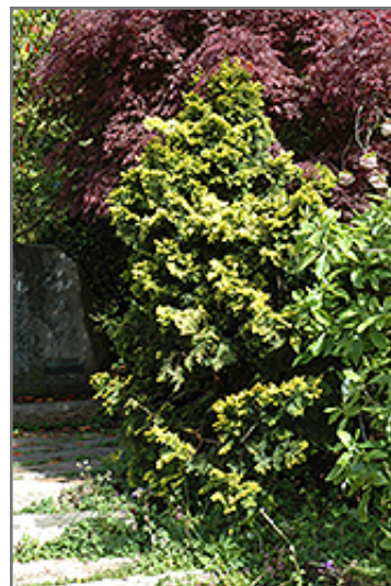
Verdon Dwarf Hinoki Falsecypress