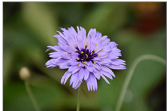
Cupid's Dart flowers