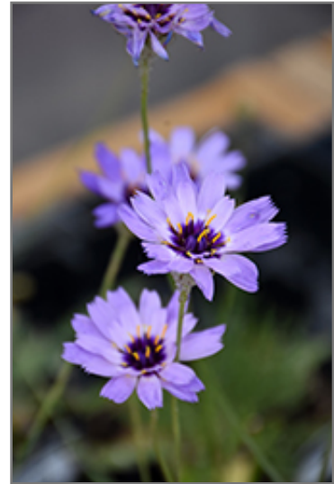
Cupid's Dart flowers

Cupid's Dart is recommended for the following landscape applications;