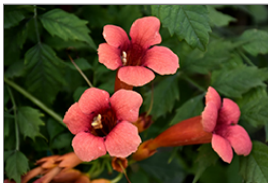
Flamenco Trumpetvine flowers

This is a high maintenance woody vine that will require regular care and upkeep, and can be pruned at anytime. It is a good choice for attracting birds and hummingbirds to your yard, but is not particularly attractive to deer who tend to leave it alone in favor of tastier treats. Gardeners should be aware of the following characteristic(s) that may warrant special consideration;