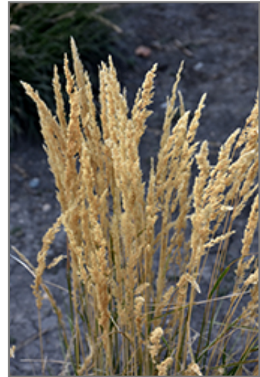
El Dorado Feather Reed Grass fruit

El Dorado Feather Reed Grass is a fine choice for the garden, but it is also a good selection for planting in outdoor pots and containers. Because of its height, it is often used as a 'thriller' in the 'spiller-thriller-filler' container combination; plant it near the center of the pot, surrounded by smaller plants and those that spill over the edges. It is even sizeable enough that it can be grown alone in a suitable container. Note that when growing plants in outdoor containers and baskets, they may require more frequent waterings than they would in the yard or garden. Be aware that in our climate, most plants cannot be expected to survive the winter if left in containers outdoors, and this plant is no exception. Contact our experts for more information on how to protect it over the winter months.