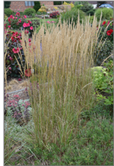
El Dorado Feather Reed Grass

El Dorado Feather Reed Grass is recommended for the following landscape applications;