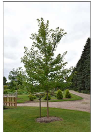
Matador Maple