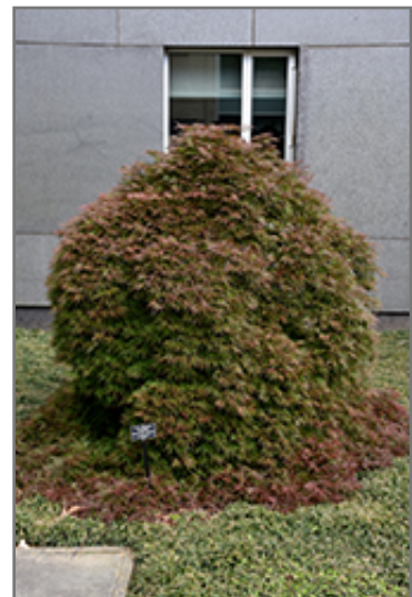
Orangeola Cutleaf Japanese Maple