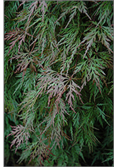
Orangeola Cutleaf Japanese Maple foliage

Orangeola Cutleaf Japanese Maple is recommended for the following landscape applications;