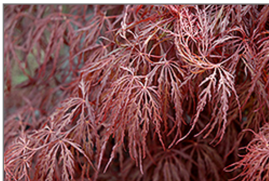
Crimson Queen Japanese Maple foliage

Crimson Queen Japanese Maple is recommended for the following landscape applications;