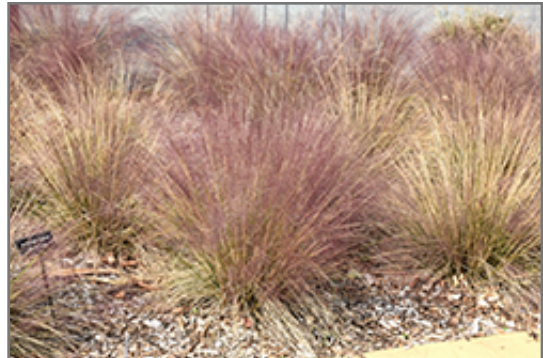
Hairawn Muhly in fall