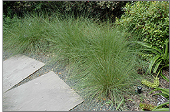
Hairawn Muhly

Hairawn Muhly is recommended for the following landscape applications;