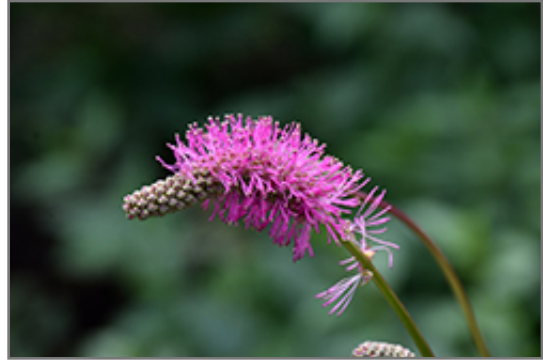
Japanese Bottlebrush flowers

Japanese Bottlebrush is recommended for the following landscape applications;