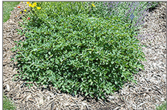
Japanese Bottlebrush