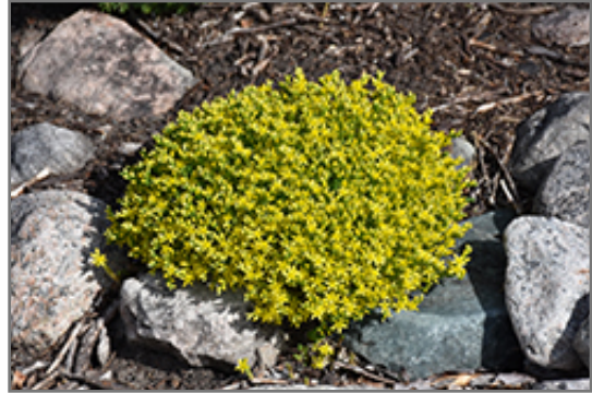
Golden Moss Stonecrop in bloom

Golden Moss Stonecrop is recommended for the following landscape applications;