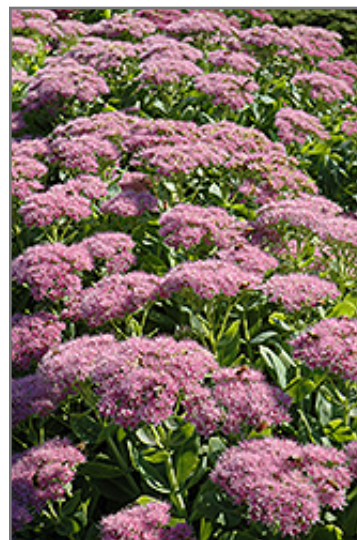
Brilliant Stonecrop flowers

Brilliant Stonecrop is recommended for the following landscape applications;