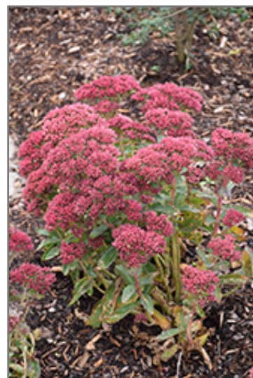
Munstead Dark Red Stonecrop in bloom