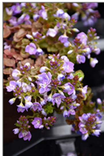
Crystal River Speedwell flowers

Crystal River Speedwell is a fine choice for the garden, but it is also a good selection for planting in outdoor pots and containers. Because of its spreading habit of growth, it is ideally suited for use as a 'spiller' in the 'spiller-thriller-filler' container combination; plant it near the edges where it can spill gracefully over the pot. Note that when growing plants in outdoor containers and baskets, they may require more frequent waterings than they would in the yard or garden. Be aware that in our climate, most plants cannot be expected to survive the winter if left in containers outdoors, and this plant is no exception. Contact our experts for more information on how to protect it over the winter months.