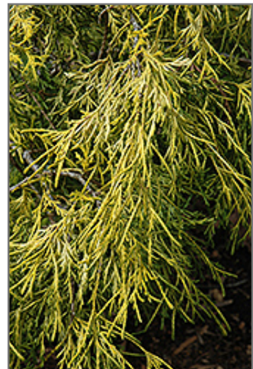
Lemon Thread Falsecypress foliage