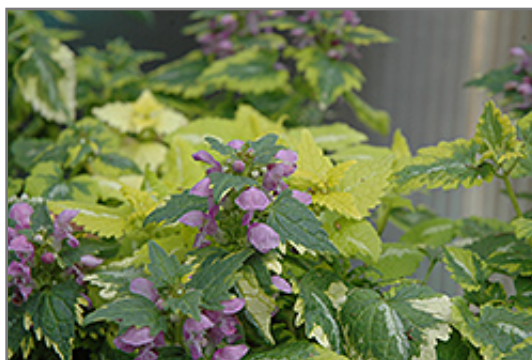
Anne Greenaway Spotted Dead Nettle flowers