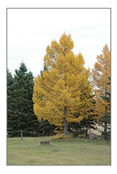
European Larch in fall