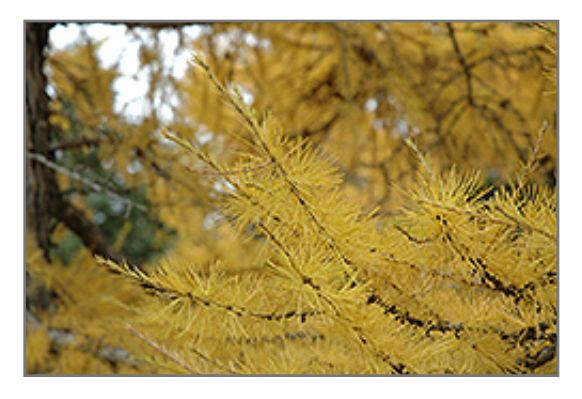
European Larch in fall