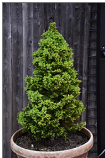
Rainbow's End Spruce