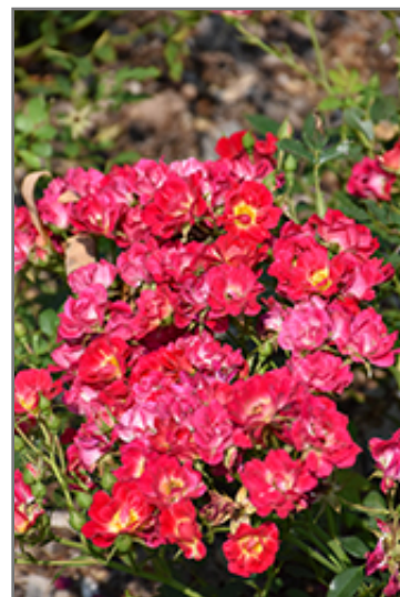
Pink Drift Rose flowers