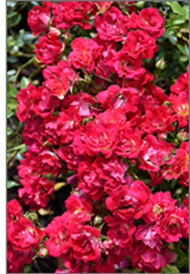
Red Drift Rose flowers

Red Drift Rose is recommended for the following landscape applications;