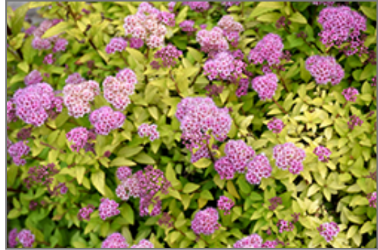
Sundrop Spirea flowers

Sundrop Spirea is recommended for the following landscape applications;