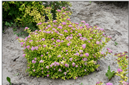
Sundrop Spirea in bloom