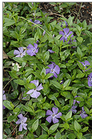
Common Periwinkle in bloom

Common Periwinkle is recommended for the following landscape applications;