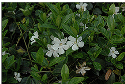
White Periwinkle flowers