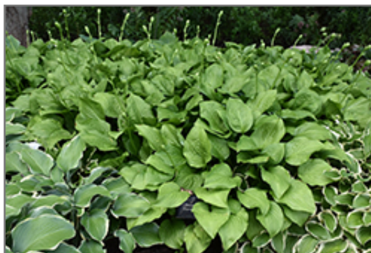
Royal Standard Hosta

Royal Standard Hosta is recommended for the following landscape applications;