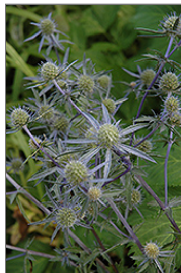
Blue Cap Sea Holly flowers