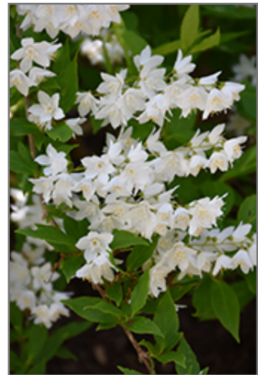
Chardonnay Pearls Deutzia flowers