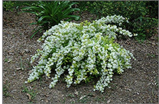
Chardonnay Pearls Deutzia in bloom

Chardonnay Pearls Deutzia is recommended for the following landscape applications;