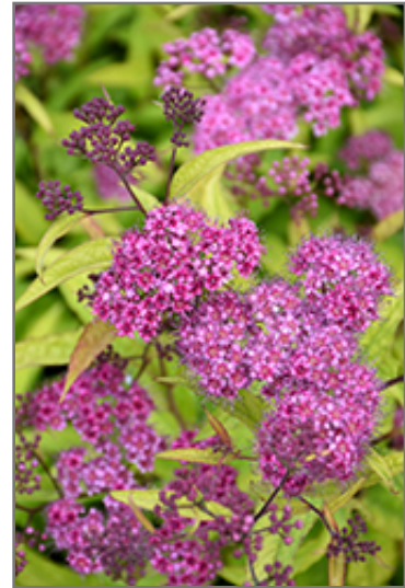
Flaming Mound Spirea flowers

Flaming Mound Spirea is recommended for the following landscape applications;