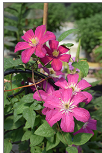
Barbara Harrington Clematis flowers