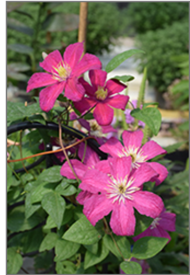
Barbara Harrington Clematis flowers