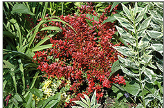
Cherry Bomb Japanese Barberry