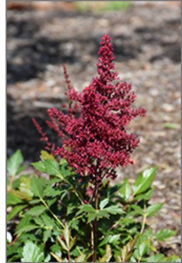
Red Sentinel Astilbe flowers

Red Sentinel Astilbe is a fine choice for the garden, but it is also a good selection for planting in outdoor pots and containers. With its upright habit of growth, it is best suited for use as a 'thriller' in the 'spiller-thriller-filler' container combination; plant it near the center of the pot, surrounded by smaller plants and those that spill over the edges. Note that when growing plants in outdoor containers and baskets, they may require more frequent waterings than they would in the yard or garden. Be aware that in our climate, most plants cannot be expected to survive the winter if left in containers outdoors, and this plant is no exception. Contact our experts for more information on how to protect it over the winter months.