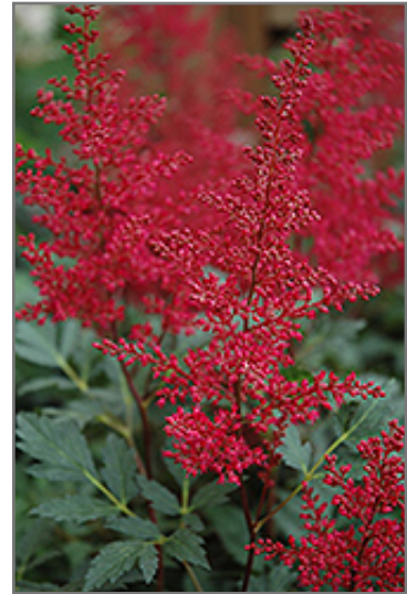
Red Sentinel Astilbe flowers

Red Sentinel Astilbe is recommended for the following landscape applications;