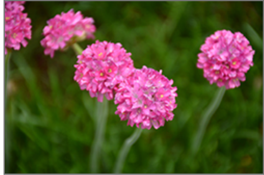
Bloodstone Sea Thrift flowers

Bloodstone Sea Thrift will grow to be only 6 inches tall at maturity extending to 10 inches tall with the flowers, with a spread of 18 inches. Its foliage tends to remain low and dense right to the ground. It grows at a slow rate, and under ideal conditions can be expected to live for approximately 10 years. As an evergreen perennial, this plant will typically keep its form and foliage year-round.