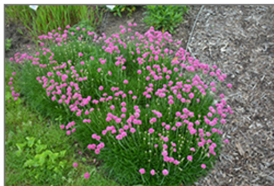
Bloodstone Sea Thrift in bloom