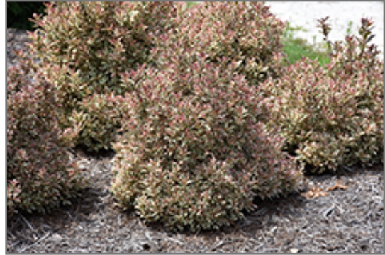
My Monet Weigela

My Monet Weigela makes a fine choice for the outdoor landscape, but it is also well-suited for use in outdoor pots and containers. It is often used as a 'filler' in the 'spiller-thriller-filler' container combination, providing a mass of flowers and foliage against which the thriller plants stand out. Note that when grown in a container, it may not perform exactly as indicated on the tag - this is to be expected. Also note that when growing plants in outdoor containers and baskets, they may require more frequent waterings than they would in the yard or garden. Be aware that in our climate, most plants cannot be expected to survive the winter if left in containers outdoors, and this plant is no exception. Contact our experts for more information on how to protect it over the winter months.