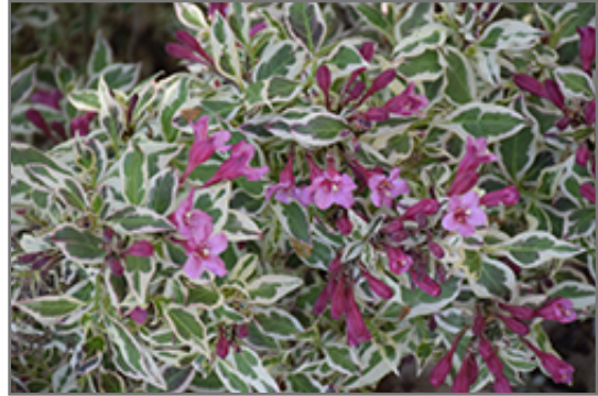
My Monet Weigela flowers

My Monet Weigela is recommended for the following landscape applications;