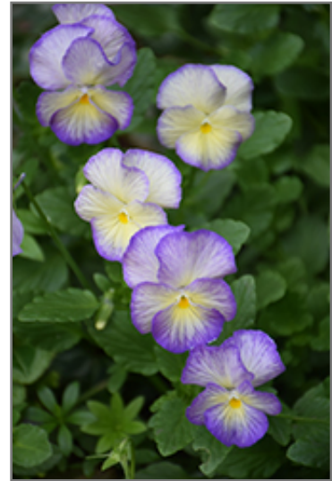
Etain Pansy flowers

Etain Pansy is recommended for the following landscape applications;