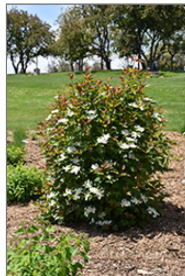
Redwing Highbush Cranberry in bloom