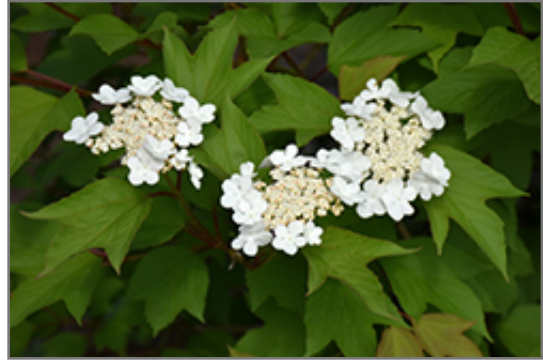
Redwing Highbush Cranberry flowers

Redwing Highbush Cranberry is a dense multi-stemmed deciduous shrub with an upright spreading habit of growth. Its average texture blends into the landscape, but can be balanced by one or two finer or coarser trees or shrubs for an effective composition.