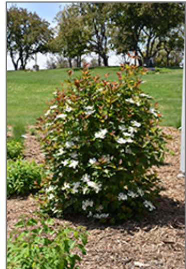
Redwing Highbush Cranberry in bloom