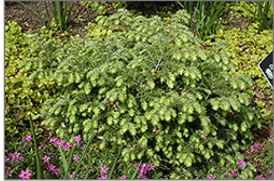
Moon Frost Hemlock

Moon Frost Hemlock is recommended for the following landscape applications;