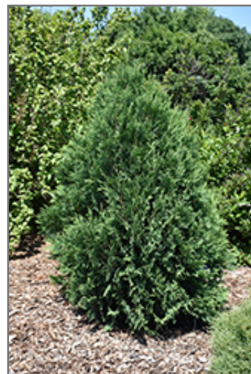
Technito Arborvitae