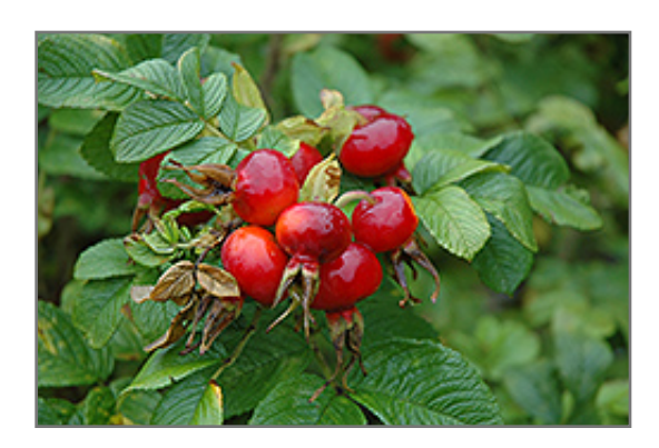
Rugosa Rose fruit

This shrub should only be grown in full sunlight. It does best in average to evenly moist conditions, but will not tolerate standing water. It is not particular as to soil type or pH, and is able to handle environmental salt. It is highly tolerant of urban pollution and will even thrive in inner city environments. This species is not originally from North America.