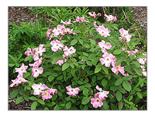
Rugosa Rose in bloom