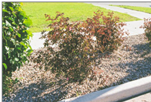
Red Leaf Rose