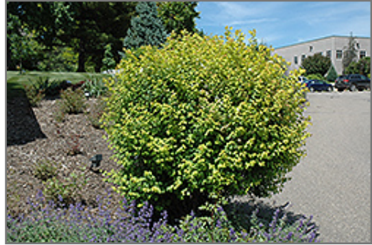
Firegold Spirea

Firegold Spirea is recommended for the following landscape applications;