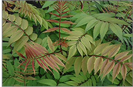
Sem False Spirea foliage

This shrub will require occasional maintenance and upkeep, and is best pruned in late winter once the threat of extreme cold has passed. Gardeners should be aware of the following characteristic(s) that may warrant special consideration;