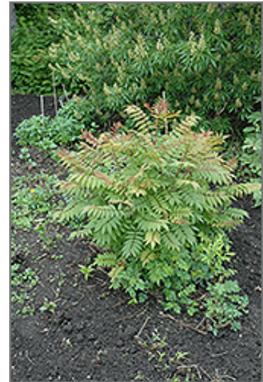
Sem False Spirea