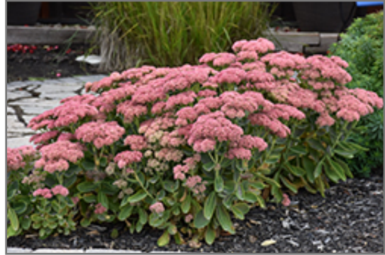
Autumn Fire Stonecrop in bloom

Autumn Fire Stonecrop is recommended for the following landscape applications;