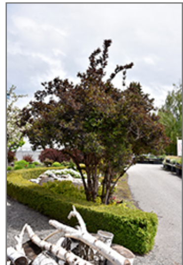
Black Beauty Elder