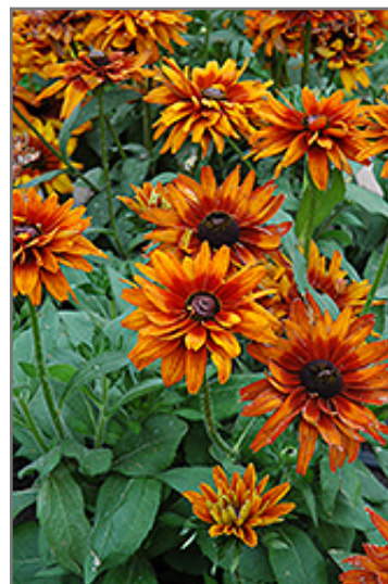
Cherokee Sunset Coneflower flowers