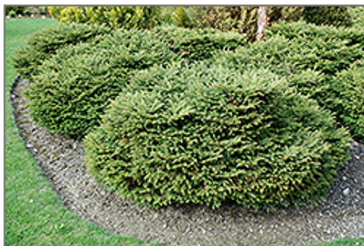
Creeping Norway Spruce