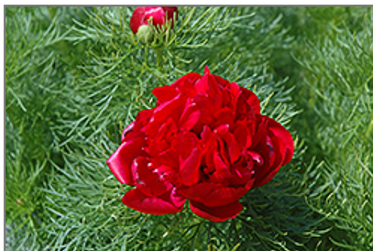
Double Fernleaf Peony flowers