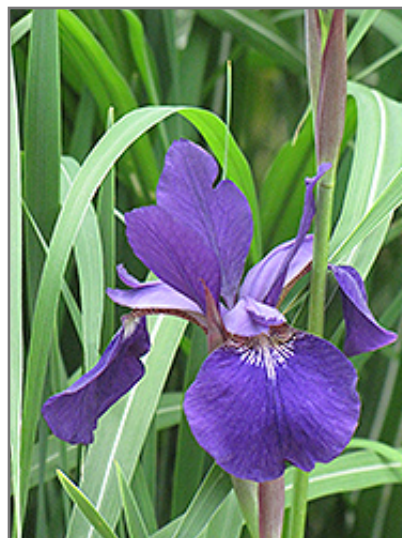
Caesar's Brother Siberian Iris flowers