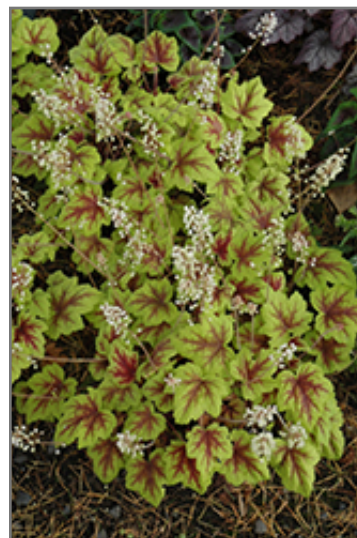
Stoplight Foamy Bells in bloom

Stoplight Foamy Bells is recommended for the following landscape applications;