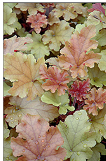
Marmalade Coral Bells foliage

This is a relatively low maintenance plant, and should be cut back in late fall in preparation for winter. It is a good choice for attracting hummingbirds to your yard. It has no significant negative characteristics.