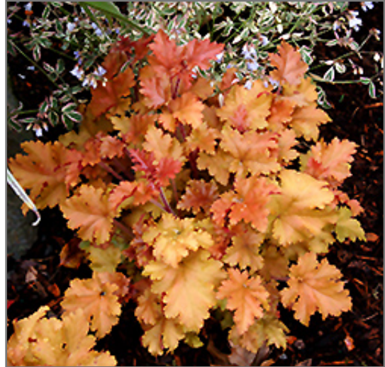
Marmalade Coral Bells foliage

Marmalade Coral Bells will grow to be about 8 inches tall at maturity extending to 18 inches tall with the flowers, with a spread of 16 inches. When grown in masses or used as a bedding plant, individual plants should be spaced approximately 14 inches apart. Its foliage tends to remain low and dense right to the ground. It grows at a medium rate, and under ideal conditions can be expected to live for approximately 10 years. As an evergreen perennial, this plant will typically keep its form and foliage year-round.